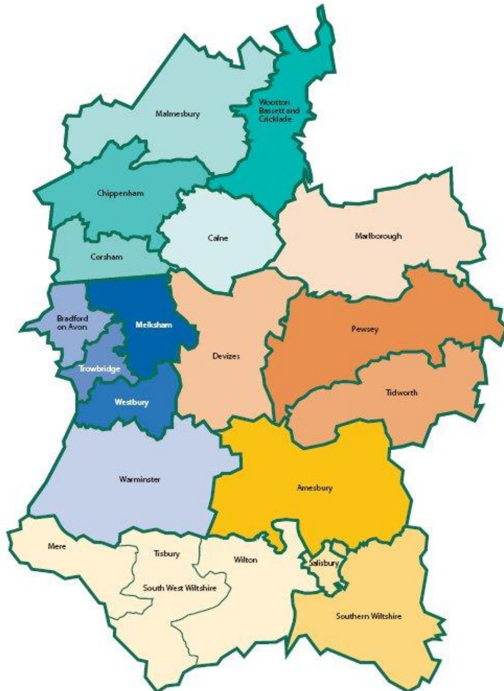
Figure 1: Map of community areas in Wiltshire